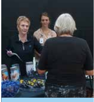
Hall About Health Expo at VMCA